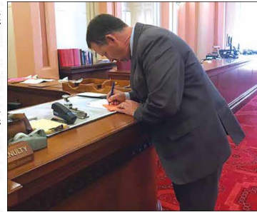
SCA 7 will give voters a say on the election of CPUC commissioners.

Senator Brian Dahle represents California's 1st Senate District, which contains all or portions of Alpine, El Dorado, Lassen, Modoc, Nevada, Placer, Plumas, Sacramento, Sierra, Siskiyou, and Shasta Counties.