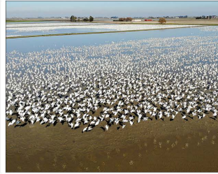
Snow geese take flight from the surface of a flooded rice field Jan. 31 in Willows.